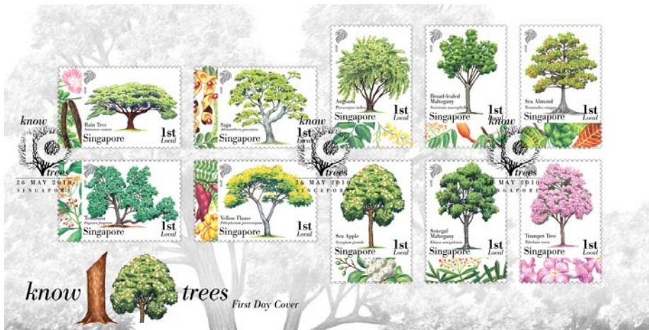
Pre-cancelled First Day Cover affixed with complete set of stamps (Price: S$3.40)

Singapore, 24 May 2010 - There are over 2,000 recorded native plants found in Singapore, and about two million trees - nearly half the size of Singapore’s population - planted along roadsides, in parks and public open space.